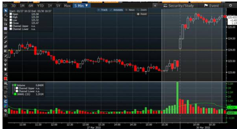
Figure 12. Volume of Apple Inc.'s share traded

Notes: Intraday trading for AAPL using candlestick pattern with corresponding volume. Highlighted area signals heavier trading (buying) volume as investors started to buy into the position as closing bell approaches