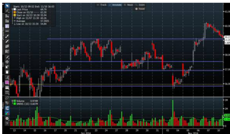
Notes: Daily trading for M using candlestick pattern with corresponding volume. Lower two lines represent levels of support (lower bound) and resistance (upper bound). Macy's new levels of support (lower bound) and resistance (upper bound) are represented by the top two lines