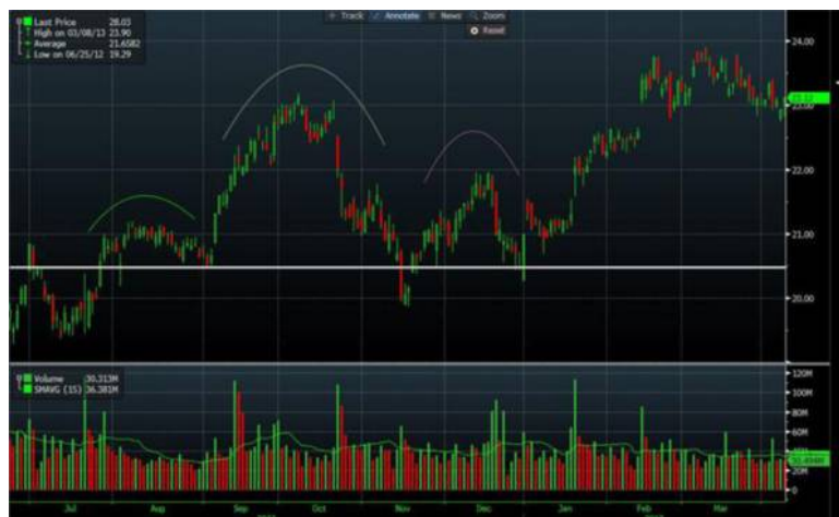
Figure 2. General electric – head and shoulders pattern

Time. Time is a key component of technical analysis and relates directly to the time frame of investment and price. Before choosing an investment or trade, a time frame needs to be decided upon. Faculty should teach their students what timeframes to look at depending on how long they want to be in the trade. For example, if they were looking to invest in Company XYZ for six months looking to gain off cyclicity of their earnings, they would look at monthly, weekly and daily charts. There would be no need to micro-manage a six-month investment on a 1 min or a 5 min time frame. These short-term time frames should only be looked at for short-term trades on companies with good fundamentals that set up with positive behavioral and technical indicators. The longer an individual's holding period, the longer the term of the charts that they would look include in their analysis.