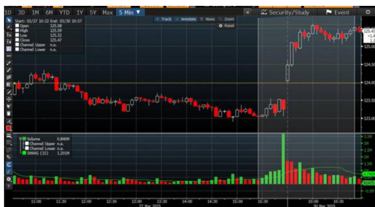
Notes: Intraday trading for AAPL using candlestick pattern with corresponding volume. Highlighted area signals heavier trading (buying) volume

Pattern. Patterns formed by price show up every day in the stock market and on all types of time frames. To help keep things simple for students, one should teach two reversal patterns and two different continuation patterns. Each pattern can be formed with slight variations, yet have the same major concept. Pattern recognition can be taught through