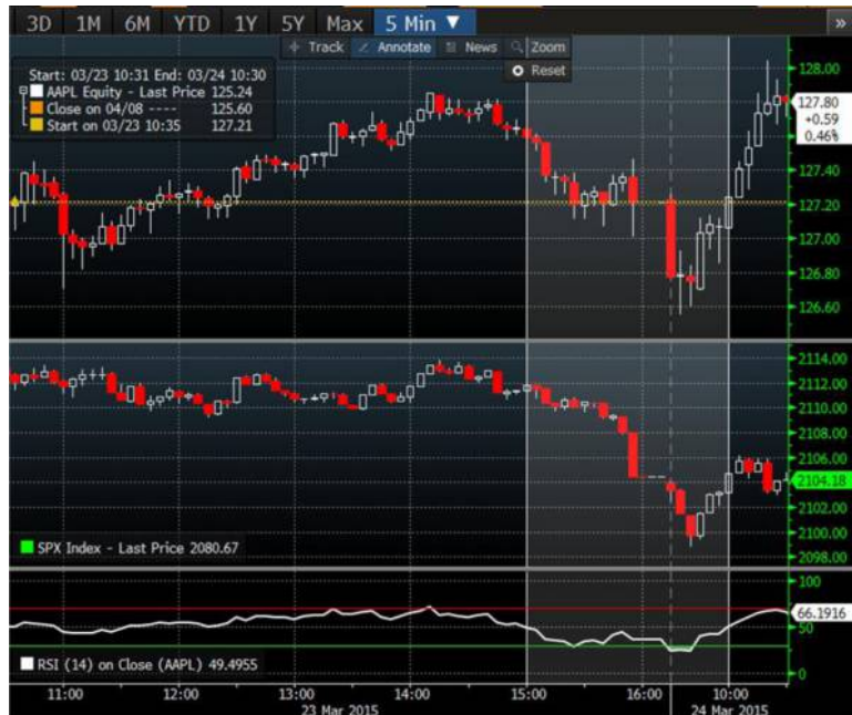
Figure 10. Comparison of Apple, Inc. (AAPL to the S&P500 using RSI)

Notes: Intraday RSI of AAPL with candlestick price comparison against the S&P 500. RSI of AAPL in highlighted area indicates an oversold position, justifying the significant increase the following day