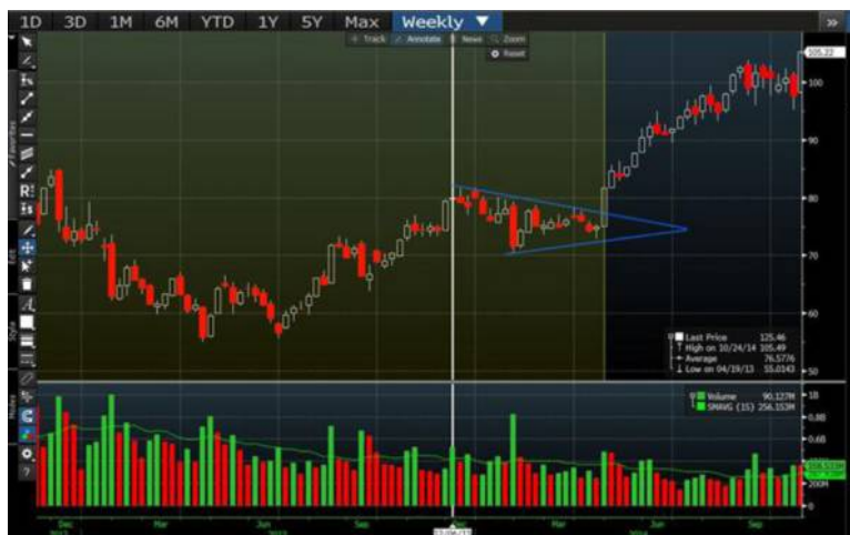
Notes: Weekly trading for AAPL using candlestick pattern with corresponding volume. The pole (or flagstick) of the Bull Flag is represented by the vertical line and the flag is designed with AAPL reaching higher lows