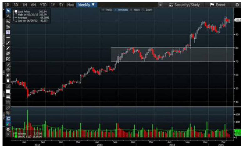
Figure 4. Price correction in Nike, Inc. (NKE)

While teaching PPTS is important, other indicators such as the Full Stochastic Oscillator, MACD, RSI, Moving Averages and Volume will also help the students to time and gauge investor sentiment about the security. Faculty must remember when using these tools, they are all calculated off the price movement of the stock. So, if one can read price, they will have a general idea where these indicators are going before they actually move and can rely on these indicators to help confirm price movements in the stock. Faculty should teach students to use these indicators in conjunction with the PPTS when looking for technical entries on stocks. If it is possible to line up multiple PPTS with any of the following indicators, then a technical low-risk, high-reward entry would be found. To a full understanding of each