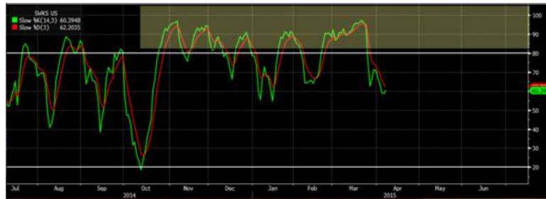
Figure 6. Full stochastic oscillator

Note: Monthly Stochastic Oscillator indicating an overbought position when greater than 80 (highlighted area) an oversold position when less than 20