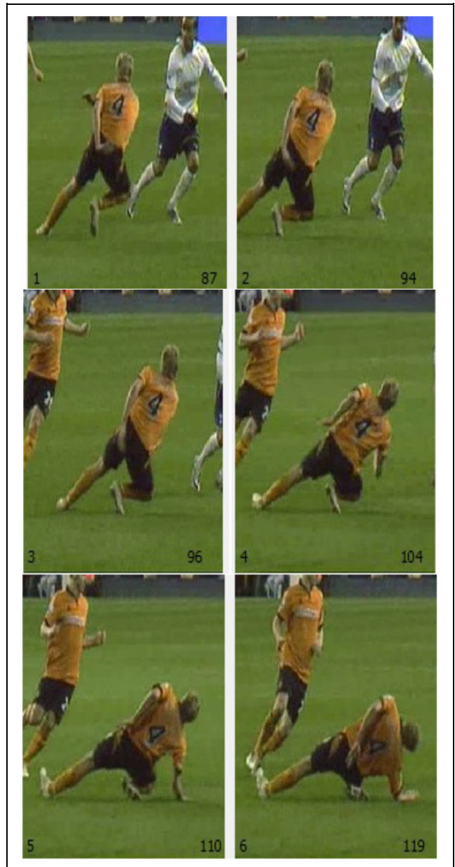
Figure 1. Series of video stills demonstrating right ankle syndesmosis injury with the ankle being forced into dorsiflexion-external rotation.

None of the players with a supination-inversion injury mechanism required surgery, but 4 players with dorsiflexion external-rotation mechanisms had clinical signs of instability