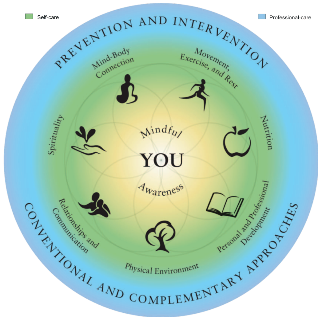
Figure 2 Duke Integrative Medicine Wheel of Health.

Copyright © 2010 by Duke University on behalf of Duke Integrative Medicine. Reprinted with permission. All rights reserved. MCOC-8720