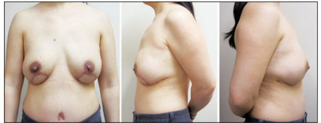
Figure 5) Final result three months postoperatively

The most concerning complication, by far, is the increased risk for breast cancer. Cheng et al (7) described two cases of breast cancer following PAAG augmentation. There is evidence to suggest that injectable biomaterial, such as PAAG, does put patients at a greater risk for breast cancer for several reasons. PAAG will inhibit the growth of human fibroblasts and may cause the apoptosis of human fibroblasts, which leaves the potential for carcinogenicity. PAAG also can alter physical parameters, such as the size and the granularity of human fibroblasts, and induce an increase in messenger RNA expression of c-myc , a regulatory gene that codes for transcription factor and growth control (7). Also, given the most common clinical manifestations are, in fact, induration or lump and inflammatory reaction caused by PAAG, this may mask the presentation of breast cancer, delaying