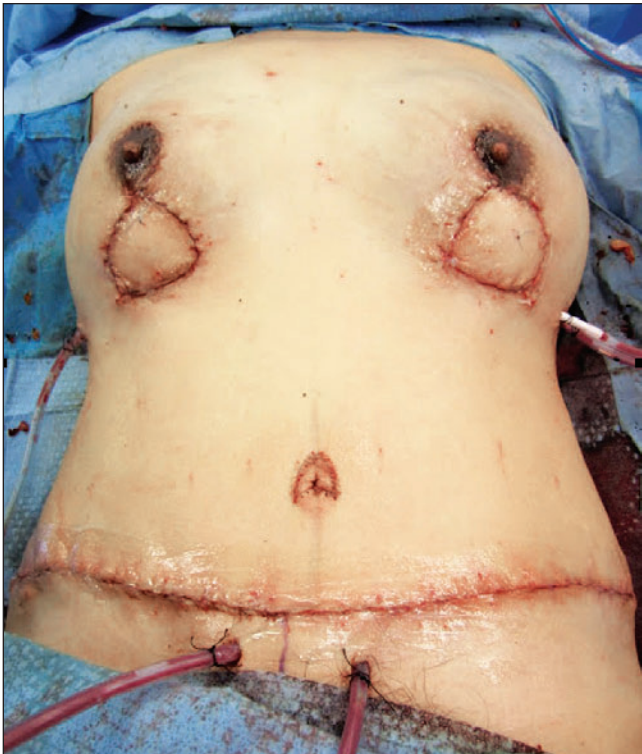
Figure 4) Postoperative appearance

a high Asian population, as well as increasing immigration from the Ukraine, and the recent popularity of the medical tourism industry.