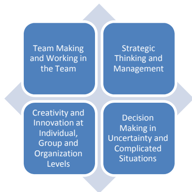
Figure 2. Fields of study for identifying criteria

identified and detected from the literature in four different fields (figure 2).