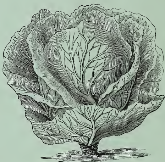
Early Wyman Cabbage.