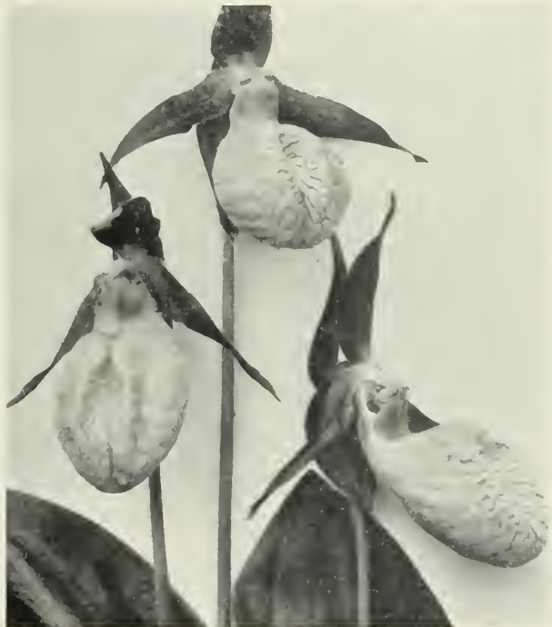
PINK LADY SLIPPER

CLOSED or BOTTLE GENTIAN , Gentiana andrewsii . Rich, very dark blue, closed blossoms in September. Neutral soil in very light shade. 12 to 18 in.