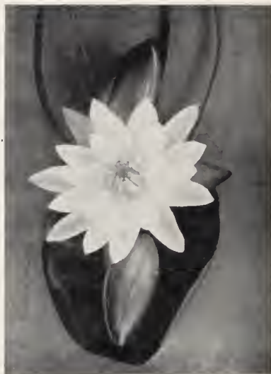
WHITE WATER LILY

PURPLE LOOSESTRIFE , Lythrum salicarium roseum . A very conspicuous, early July flower. Compact, dark pink racemes 3 to 4 feet tall. Full sun and any ordinary moist soil. For the swamp garden.