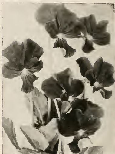
VIOLA, JERSEY GEM