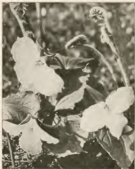
TRILLIUM GRANDIFLORUM, SNOW TRILLIUM

SOLOMONSEAL, Polygonatum biflorum . Blue berries in Autumn. Small green bell-flowers on gracefully arching leaf fronds sometimes 18 inches long in May and June. Hardwoods soil and dense shade.