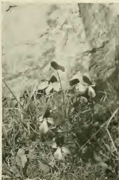
VIOLA PEDATA BICOLOR

WOODSORREL , Oxalis acetosella . Delicate, white petaled flowers veined with pink lines. Leaves like Shamrock. Quite dense shade and leaf mold. 2 to 4 in.