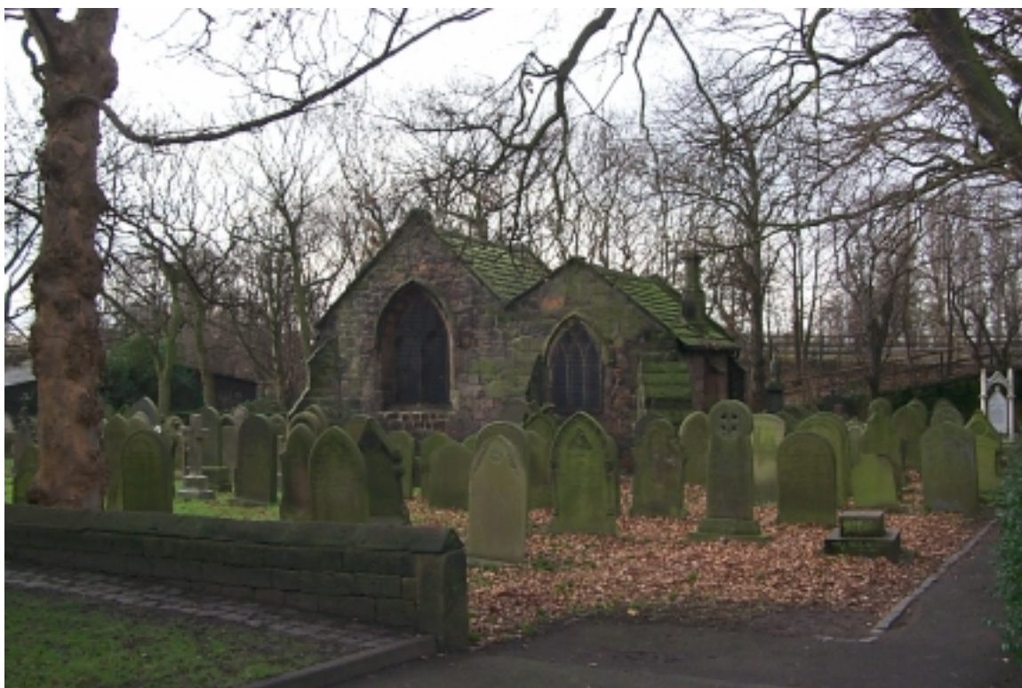
The Ancient Chapel of Maghull in the grounds of St. Andrew's church. George-3's grave is behind the low wall to the left of the picture.