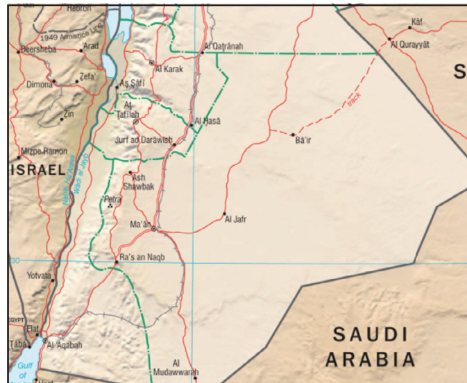
Figure 1.3 Southern Jordan