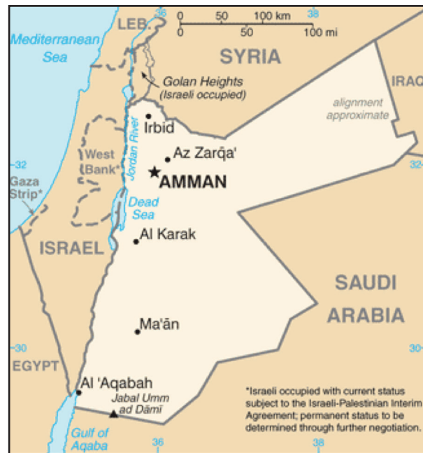
Figure 1.1 Jordan Overview