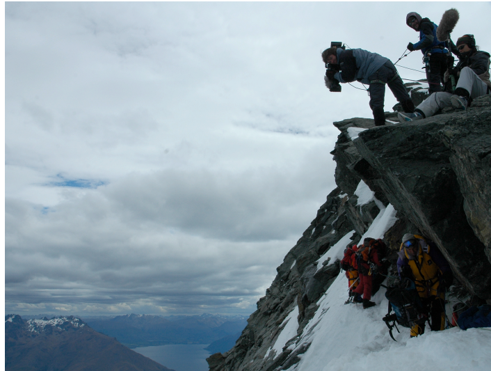
Film crew reconstructing Everest scenes at the Remarkables

As Ward observes ethical questions arise when archive footage “is made to perform” ie edited for dramatic purposes: “Notions of performance in documentary are therefore potentially controversial ... and are deemed to be a central problematic for a film’s documentary status or credentials.” (Ward 2008, p193)