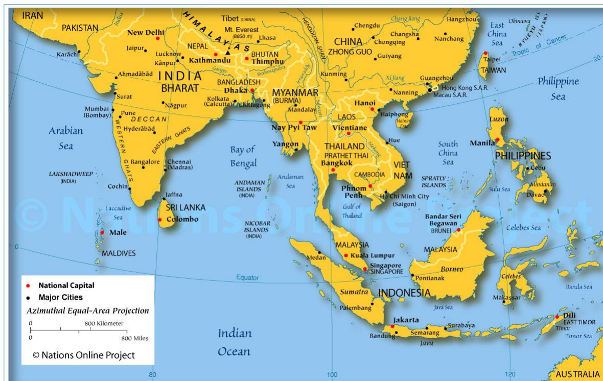
Figure 1: Map of South East Asia