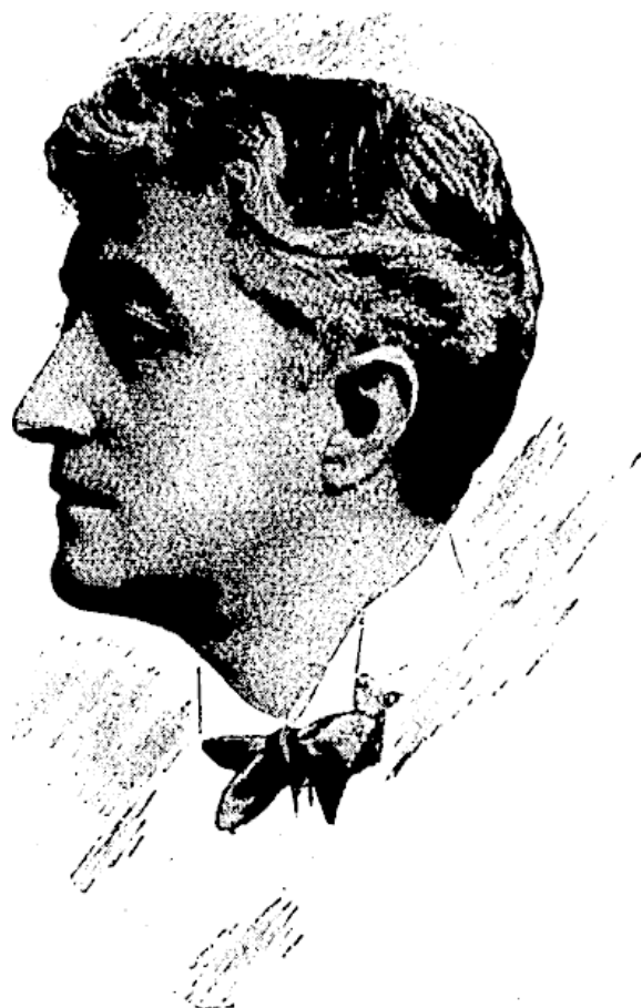
PAUL DFAULT, THE FAMOUS FRENCH-CANADIAN. 7