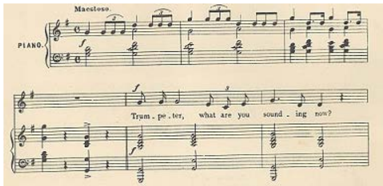
Example 3: Opening bars of The Trumpeter , J. Airlie Dix (Boosey & Co. 1904).

Chaminade's accompaniment is also chordal, but rather than following the melody, it has a dancing quality, by way of the leggiero marking and placing the chords on the off beats of the bar. It is made lighter in feel by less frequent bass notes, unlike the heavy octave left hand movement in The Trumpeter . Perhaps the fanfare-like opening represented 'the blue country' that was being recalled. The vocal line then uses the triplet rhythm of the introduction throughout the whole song. However, with the dynamic reduced to piano , along with a somewhat sparse accompaniment, Chaminade created a sense of lightness, belying what one might expect after hearing the opening bars.