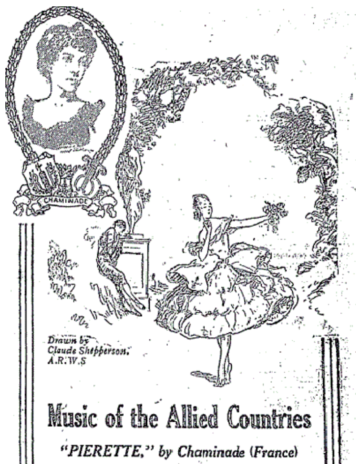
Figure 3: Pictorial advertisement for the Pianola, as it appeared in the Otago Daily Times , July 7, 1917.

Unlike previous years, with names such as Mark Hambourg and Puccini endorsing the pianola, Chaminade was the only living celebrity to feature so prominently in the 1917 advertising campaign in New Zealand. Her name was also linked to Chappell Pianos in a campaign marketed by Auckland piano importer Lewis Eady, which was clearly directed at the man of the house, and extolled the happiness experienced when getting ‘her’ a piano: