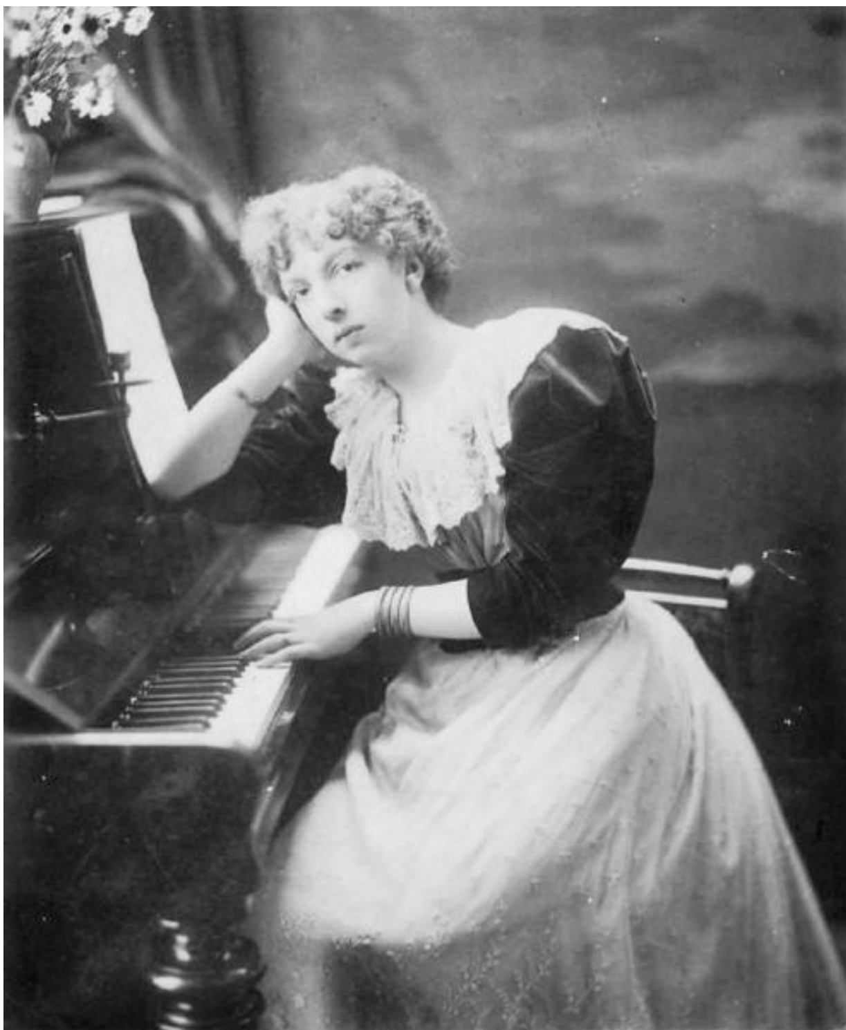
Figure 1: Cécile Chaminade (1857-1944)