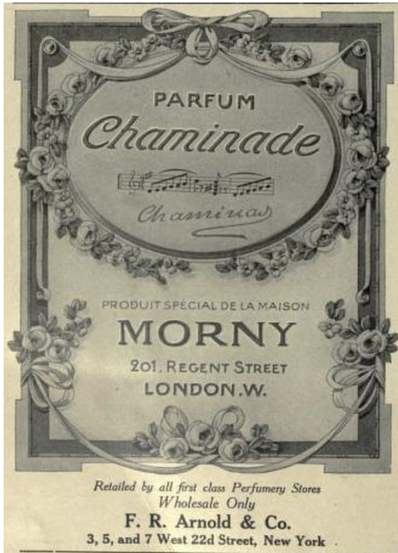
Figure 2: Vintage Advertisement of Chaminade perfume by Morny, 1911.

In 1913 the French Government awarded Chaminade the Legion of Honour, the first time a woman composer had ever received this award. 27 She had already been previously presented with the Jubilee Medal from Queen Victoria in 1897, and the Chefekat (a ribbon that was bestowed exclusively upon women) from the Sultan of Constantinople in 1901. 28