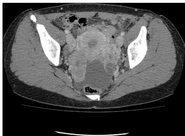
Figure 1 Enhanced axial CT showing bilateral adnexal tumors.

International Federation of Gynecology and Obstetrics (FIGO) Stage IIb ovarian serous adenocarcinoma and left breast invasive ductal carcinoma.