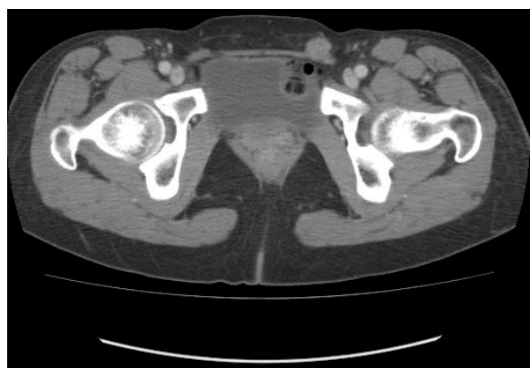
Figure 2 Enhanced axial CT shows a left inguinal mass, 18 mm in size (arrow).

Almost 2 years after her initial ovarian cancer operation, the patient noticed a left inguinal mass. CT showed a left inguinal mass, 18 mm in size (Figure 2), but no abnormal mass in chest, abdomen or pelvis. This mass was located on the fascia and medially to the femoral vein. The serum CA125 level was within normal limits. A fine-needle aspiration of the left inguinal mass revealed cells consistent with adenocarcinoma, but it was difficult to confirm the location of the primary lesion. She underwent an excision biopsy of the left