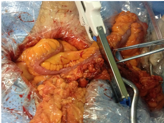
Figure 4 Functional end-to-end anastomosis: resection of ileocecal site using stapler.

Data presented as mean ± standard deviation or n (%). TNM, ‘tumor, node, metastases’.