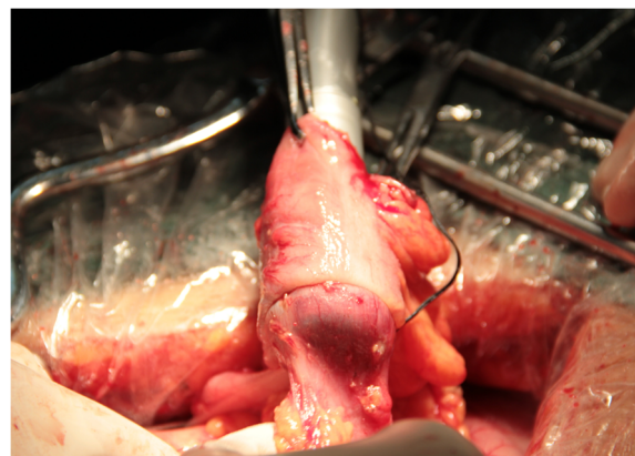
Figure 1 End-to-side anastomosis: withdrawal of circular stapler.

For the FEEA maneuver, small holes were made in the walls of the ileum and the colon using an electric scalpel. The prongs of the linear stapler (Proximate, TLC75 or TLC10; Ethicon Endo-Surgery, Cincinnati, Ohio) were inserted in these holes and were fired to perform the anastomosis (Figure 3). We waited for 30 s before releasing the stapler to allow for hemostasis. The mucosal