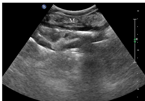
Figure 2 Data for a 37-year-old man. Ultrasonography showed a cake-shaped thickening of the omentum (M) with homogeneous hyperechoes; this thickening was then pathologically diagnosed as tuberculosis of the peritoneum.

The complications were evaluated within 12 hours after the biopsy. Fifteen patients experienced pain at the operation site, which eased off later without treatment.