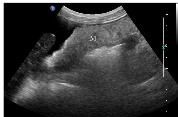
Figure 1 Data for a 56-year-old woman. Ultrasonography showed a cake-shaped thickening of the omentum and a nodosity-shaped thickening of the peritoneum (M); these thickenings were pathologically diagnosed as metastatic mucinous adenocarcinoma.

The accurate identification of the peritoneal and omental lesions by ultrasonography is essential for the success of the biopsy. Here, all of the patients had a locally or diffusely thickening peritoneum (thickness range, 0.8 to 3.7 cm; mean thickness, 1.7 \pm 0.8 cm). Among all the patients, 114 had a cake-shaped thickening of the peritoneum or omentum (Figure 1), and 39 had a nodous peritoneum or omentum. Overall, 74 patients with a thickened omentum had a heterogeneous hypoechoic pattern, 59 patients had a hyperechoic pattern, and 20 patients had both patterns. The thickened peritoneum or omentum tended to be stiff, and it made the lesions hard to deform with the transducer compression. Ascites were present in 123 patients; of these, 30 had a large volume, 42 had a moderate volume, and 51 had a small volume.