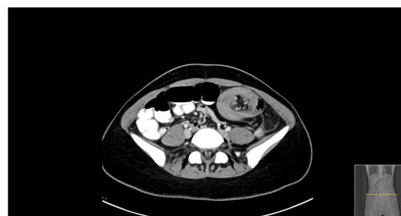
Figure 2 Axial section of abdominal CT revealing "target" sign of ileocolic intussusception in left abdomen.

The CT scan was concerning for total ileocolic intussusception to the level of the rectum with possible compromised bowel. The patient was brought to the OR for an urgent exploratory laparotomy. The distal small bowel was invaginated into the colon throughout its entire length and could be palpated in the upper rectum (Figure 4). The patient had a highly mobile colon with essentially absent flexures, without evidence of malrotation. We elected to proceed with distal to proximal reduction given the fact that a subtotal colectomy would have been mandated without this maneuver. The key technical points in performing this maneuver include localizing the distal aspect of the intussusception and careful milking proximally without undue manual pressure, in order to avoid inadvertent perforation. Success likely hinges on operative exploration early in the pathophysiological process. After successful reduction, a firm rubbery mass was palpated in the cecum. A formal right hemicolectomy was performed, given the risk of potential malignancy. Further exploration revealed a lipomatous mass in the wall of the proximal jejunum and segmental resection was performed. She was discharged home on post-operative day 10. Pathology revealed a fully resected 4 centimeter villous adenoma with foci of high grade dysplasia in the cecum. There was evidence of mucosal edema and lymphostasis in the adjacent