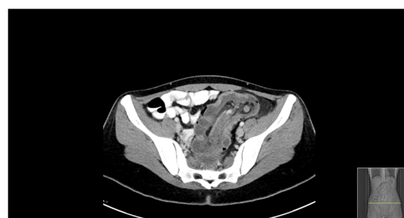
Figure 3 Axial section of pelvic CT revealing "sausage" sign of ileocolic intussusception to level of rectum.