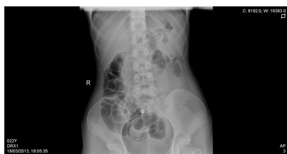
Figure 1 Plain abdominal supine radiograph revealing small bowel obstructive pattern with paucity of gas in colon.

Intraoperative strategy in adult intussusception generally favors resection without reduction in adults given the high preponderance of tumoral lesions as lead points. As detailed in this case report, extensive intussusceptions involving the right colon may be selectively