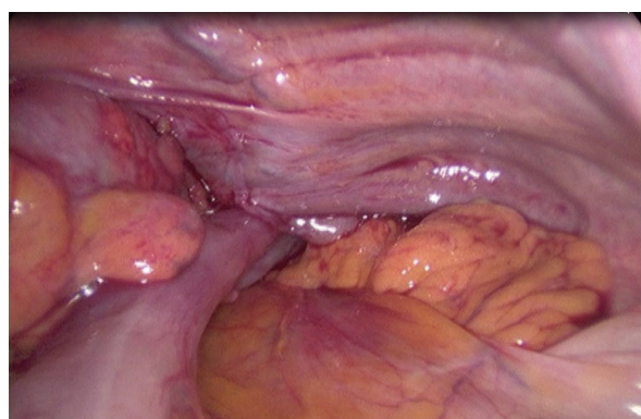
Figure 4 Peroperative picture: colon transversum disappearing through the diaphragmatic defect.

ipsilateral diaphragmatic rupture can be called a life-saving combination. Unfortunately this diaphragmatic defect led to colonic herniation after one week thus allowing a chest tube to perforate the colon through suction. When a traumatic tension pneumothorax is clinically suspected a needle decompression should be performed. In the absence of haemodynamic compromise, it is prudent to wait for the results of an emergent chest x-ray prior to intervention. Afterwards a standard chest radiograph helps to look for signs of diaphragmatic herniation: elevation of the hemidiaphragm or the presence of bowel or stomach in the chest. A nasogastric tube can be seen above the diaphragm in herniation of the stomach. When a diaphragmatic rupture is suspected a laparoscopy or thoracoscopy should be performed even with a negative computed tomography. A cautious approach is advised because a laparoscopy undertaken on a patient with a diaphragmatic rupture can lead to an iatrogenic tension pneumothorax. A diaphragmatic rupture must be repaired in presence of