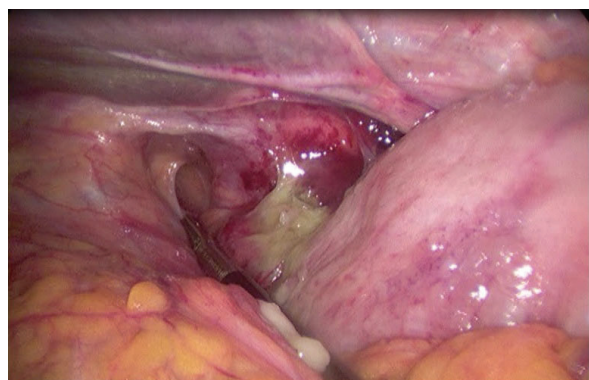
Figure 3 Peroperative picture: left posterior diaphragmatic rupture.

ipsilateral diaphragmatic rupture can be called a life-saving combination. Unfortunately this diaphragmatic defect led to colonic herniation after one week thus allowing a chest tube to perforate the colon through suction. When a traumatic tension pneumothorax is clinically suspected a needle decompression should be performed. In the absence of haemodynamic compromise, it is prudent to wait for the results of an emergent chest x-ray prior to intervention. Afterwards a standard chest radiograph helps to look for signs of diaphragmatic herniation: elevation of the hemidiaphragm or the presence of bowel or stomach in the chest. A nasogastric tube can be seen above the diaphragm in herniation of the stomach. When a diaphragmatic rupture is suspected a laparoscopy or thoracoscopy should be performed even with a negative computed tomography. A cautious approach is advised because a laparoscopy undertaken on a patient with a diaphragmatic rupture can lead to an iatrogenic tension pneumothorax. A diaphragmatic rupture must be repaired in presence of