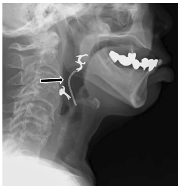
Figure 2 Radiograph of the neck showing a denture lodged in the pharygo-larynx (arrow).

She was, thus, transported to the operating room for removal of the foreign body under general anesthesia. Before surgery, the first author consulted with the anesthesiologists regarding the findings of physical examination of the airway, and several airway management strategies were prepared, including tube exchangers, fiberscopic intubation, and direct laryngoscopes. We also kept a tracheostomy kit ready, in case of failure to intubate. After preoxygenation via a face mask, topical lidocaine was administered into the oropharynx. Following awake video-assisted laryngoscopy with a Macintosh type blade (GlideScope®, Verathon Medical Inc., Canada)