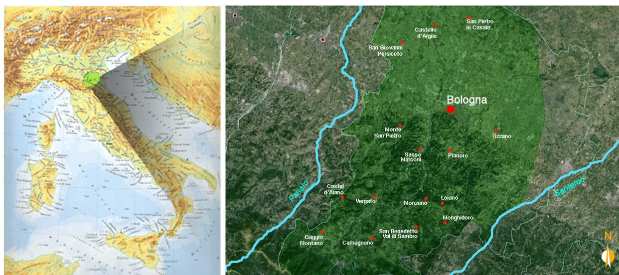
Figure 1 Location of the study area.