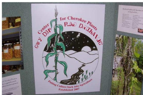
Figure 3 Official logo of the Center for Cherokee Plants.

Kevin and I went ahead and started making plans for a research schedule—and just days before we were supposed to begin—permission was officially granted by the tribe. Over the next several months we visited nearly every Cherokee community among the Eastern Band to interview gardeners and farmers who were growing and maintaining traditional cultivars (Figure 4). We conducted in-depth oral history interviews with fifteen Cherokee growers and were able to document 128 distinct folk taxa among 32 plant species being grown on the Qualla Boundary (a legal title whereby tribal land is held in trust and supervised by the Bureau of Indian Affairs of the US Government, roughly equivalent to the Reservation status of the lands of most US Indian tribes). Kevin was in charge of setting up interviews, for in his own words, he knew nearly everyone in the tribe and his family network was widespread. Kevin's lifetime of kinship and friendship networks served us well in getting interviews, many of which were with elderly gardeners who lived in deep hollers and remote communities off the back-roads of the reservation. I rode around with Kevin in his pickup truck as he told me stories of growing up as a member of the tribe, oriented me geographically with local place names and legends, and took me to special community events like the thanksgiving celebration in the traditionalist Big Cove Community, where Cherokee foods such as Bean Bread and So-chan ( Rudbeckia laciniata L.)