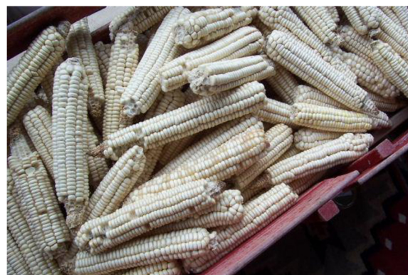
Figure 5 Cherokee White Flour Corn ( Zea mays L.).