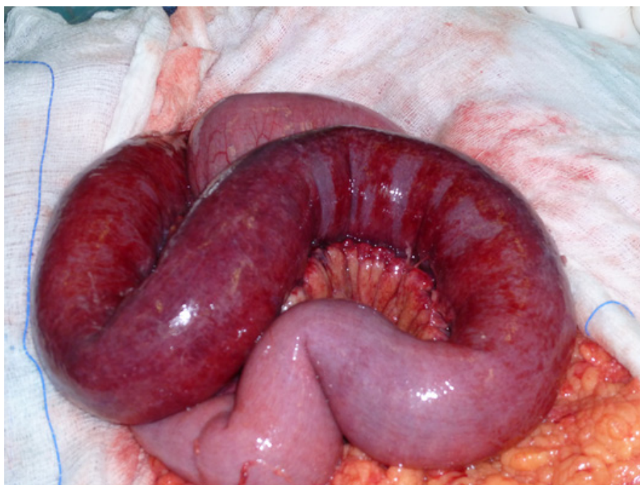
Figure 2 Photograph showing the small bowel and its associated mesentery with diffuse edema and ischemic lesions. A segmental infarction of the jejunum is present.

were identified, comprising 8 women and 3 men, all of whom were under 50 years of age [7]. Seven patients had portal and/or superior mesenteric venous thrombosis. Most patients showed no predisposing factors for thrombosis.