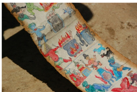
Figure 2 Dongba scroll containing the world's last remaining pictographic writing system.

The community of Dianbei has 103 households with a population of 318 and the community of Diannan has 140 households with a population of 586. Both villages settlements are located at an altitude between 2,400 m-2,600 m. The distance between the two study sites is 6.5 km. Twelve percent of the total area is under agricultural use) with forest, scrub and pasture compromising the remaining land use. Households follow subsistence livelihood relying on a mosaic of land use in their surroundings coupled with the commercialization of natural resources and off-farm labor.