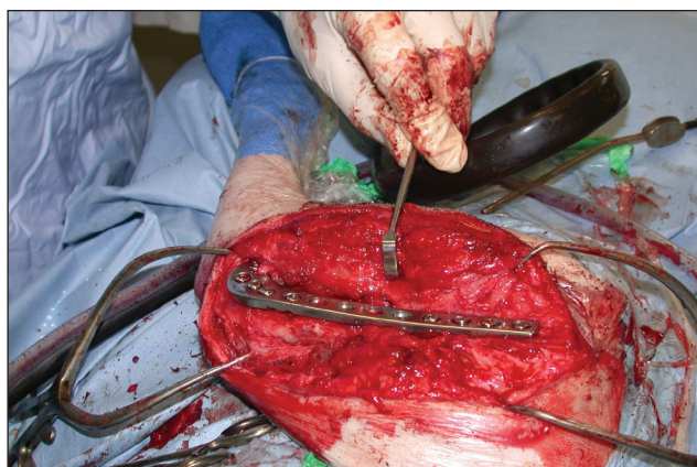
Figure 2: Intraoperative photograph showing the application of a 13 hole, 3.5 mm broad supracondylar femoral bone plate to the lateral aspect of the right femur to provide fracture stability. Four bicortical screws were placed in the proximal fragment and five in the distal fragment.

Ten days after the omentalisation procedure, the dog was anaesthetised as previously described. The right femur was approached through the previous lateral incision. The gross appearance of the fracture site was markedly improved. The omentum was viable and adhered to the fracture ends. There was abundant granulation tissue, an absence of necrotic tissue and no gross discharge evident. The plate and remaining screws were removed following gentle elevation of omentum from the lateral aspect of the femur. A 13 hole, 3.5 mm, broad supracondylar femoral bone plate (Veterinary Instrumentation, Sheffield UK) was applied to the lateral aspect of the femur. Ten cortices were achieved distally using five bicortical screws and eight cortices proximally using four bone screws. There were four vacant screw holes over the fracture site (Figure 2). A cancellous bone graft was harvested from the