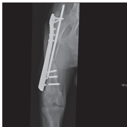
Figure 1: Craniocaudal radiograph of the right femur demonstrating fracture of the most distal two bone screws, intramedullary pin proximal migration and radiolucency surrounding the intramedullary pin and several screws (5th, 7th & 8th). There is an absence of mineralised callus. The changes are consistent with a biologically inactive femoral nonunion fracture, implant failure and suspected osteomyelitis.

Physical examination eight months after first presentation revealed marked right pelvic limb muscle atrophy. A purulent, discharging sinus was present in the proximal half of the surgical scar. Pain and instability was apparent on palpation of the femur over the fracture site. The intramedullary pin was palpable proximal to the trochanteric fossa, suggesting pin migration. Haematological and biochemical profiles were obtained and found to be within normal limits. The dog was sedated with a mixture of 10 µg/kg medetomidine and 0.2 mg/kg butorphanol administered intramuscularly. Orthogonal radiographs of the right femur were obtained. The radiographs revealed a number of abnormalities. Two of the three distal bone plate screws had fractured, the intramedullary pin had migrated proximally and there was lysis around the intramedullary pin and several bone screws (5th, 7th & 8th). There is an absence of mineralised callus at the fracture site. The radiographic changes were consistent with a biologically inactive femoral nonunion fracture, implant failure and were highly suspicious of osteomyelitis ( Figure 1 )