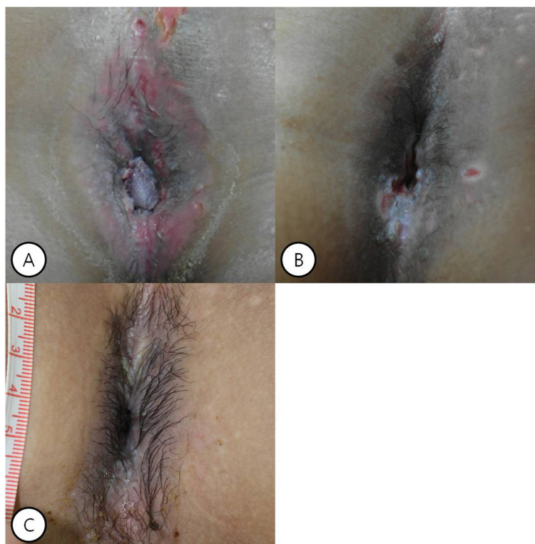
Figure 2 Gross finding of giant condyloma acuminatum of anus. (A) Six weeks after local therapy, the mass markedly decreased and was only present in the anal canal. (B) The mass was removed by local surgical excision under general anesthesia, and then bleomycin irrigation was done twice. (C) At seven months, there was no mass in the perianal and anal orifices.