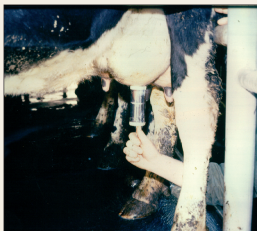
FIGURE 3: Calibrated tube in which the teat was placed to measure teat length.

lubricating gel was placed on the probe head to improve contact with the condom. The probe was manipulated until a clear image of the teat appeared on the screen. When the picture was obtained, the image was frozen on screen. Images of teats were stored on videocassette and these were subsequently measured on screen. A purpose-designed software program was used to automatically record to file the distance between two points, which were marked using a ball mouse.