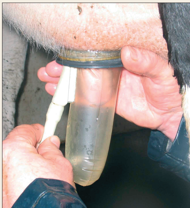
FIGURE 1: Teat placed in a condom with the probe in vertical position against the teat wall.

milking at higher system vacuum levels (Hamann et al. , 1993). Teat thickness changes of 15% were shown when system vacuum level in bucket milking plants was increased from 40 to 50kPa. It has also been shown that full teat tissue recovery after machine milking may take many hours (Gleeson et al. , 2002). This recovery time may also be influenced by milking systems using different liner types, which have been shown to result in varying degrees of teat canal penetrability (O'Brien, 1988). Liner designs commonly used in Ireland with wide upper barrel bore dimensions (31.6mm tapered to 21.0mm) give higher milk yield (Gleeson and O'Callaghan, 2001) with reduced liner slips (O'Callaghan, 2001) than narrow bore type liners. Liners with wide upper barrel bore also have a higher cavity vacuum (O'Callaghan, 1998) and a higher teat-end vacuum (O'Callaghan, 2001) compared to narrow-bore liner types. Higher teat-end vacuum will increase peak milk flow-rate (Gleeson and O'Callaghan, 1999) but may also increase teat congestion or oedema. The physical properties of liners, such as wall thickness, mounting tension and rubber hardness, will also alter the cyclic pressure applied to the teat (Hamann and Mein, 1996). Therefore, liner design is an important factor in determining the effectiveness of pulsation.