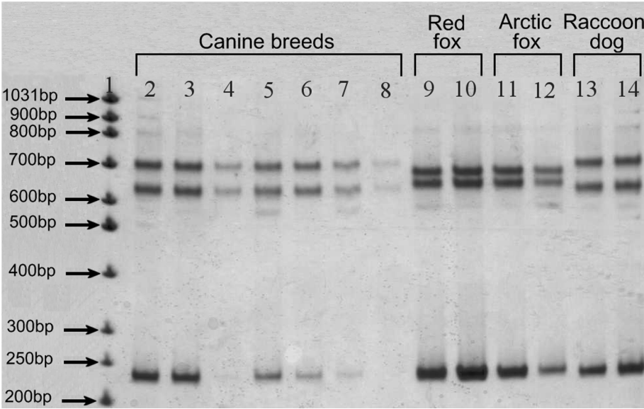
Figure 2. SSCP analysis of the second part of the leptin exon 3. Lane 1: molecular weight standard (GeneRuler™ 50 bp DNA Ladder, Fermentas); lanes 2 to 8: DNA of the different canine breeds; lanes 9 and 10: the red fox DNA; lanes 11 and 12: the arctic fox DNA; lanes 13 and 14: the racoon dog DNA.