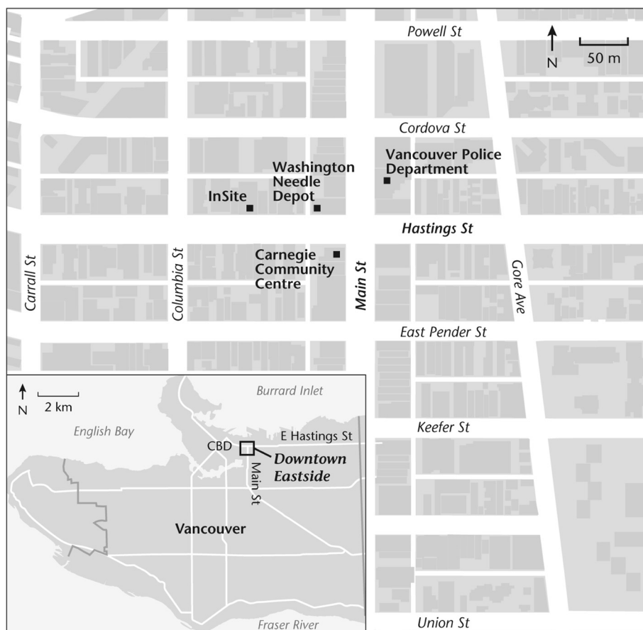
Figure 1 Map of the Downtown Eastside of Vancouver.

The city's proximity to Vancouver's DTES is unique because many IDUs can access InSite by travelling on the train for 45–60 minutes. Finally, Victoria, is a small city located on the southern tip of Vancouver Island. The city's Downtown neighborhood was chosen as a