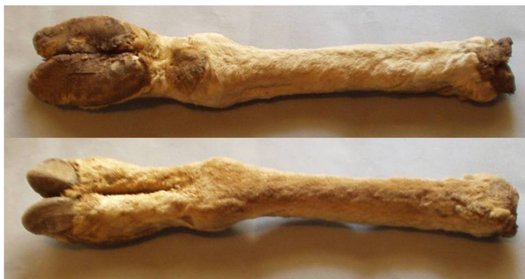
Figure 2 Guanaco leg used as medicinal resource.

causes of the low number of animals used here reported could be the restrictive legislation related to hunting and the mestizaje of population.