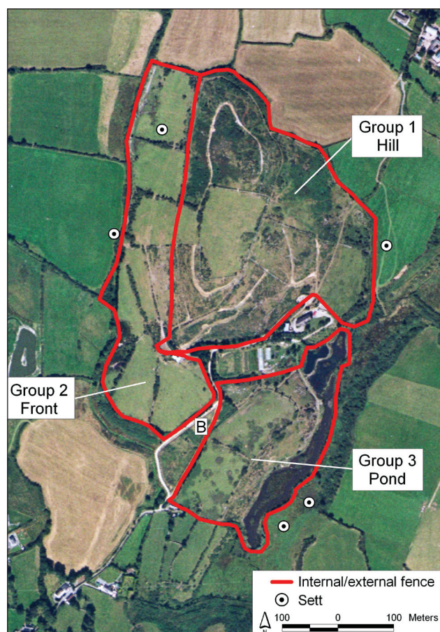
Figure 1: Map and aerial photograph of Farm A, showing the location of deer groupings (red outline), the site where a tuberculous badger was found in February 2002 (B), and the location of badger setts (white).

On both farms, calves were normally weaned during November and moved to a separate section on the farm. Apple pulp was the main supplementary winter feed, complemented with hay or dried beet nuts and was fed on a daily basis, usually in the morning, and was deposited on the ground. Deer were out-wintered, with adequate cover and shelter for the animals in adverse weather conditions. Farm A was surrounded by beef and dairy establishments and was also contiguous to a sheep flock. TB breakdowns had occurred in cattle herds around Farm A, largely coinciding with the 1994 and 2002 breakdowns in deer. Farm B was contiguous to forest and two suckler herds. The area had a lower prevalence of TB compared to the area around Farm A and the pattern of breakdowns was different in these cattle herds. Natural barriers plus adequate fencing were sufficient to prevent contact, either direct or indirect, between deer on both farms and cattle on contiguous farms.