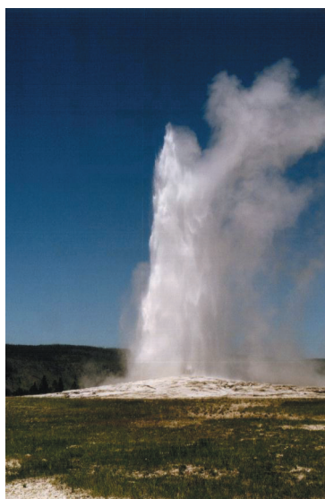
Old Faithful in Yellowstone National Park, Wyoming, USA, where Taq DNA polymerase was first discovered.

selection of applications (Table 2). So why are they of interest to veterinary medicine?