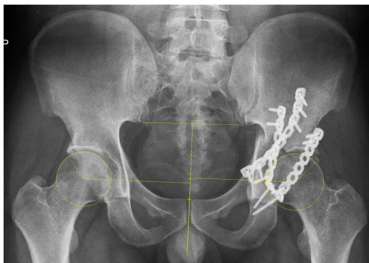
Figure 3 Postoperative shift of HJC in a poorly reduced acetabular fracture. The fracture type is transverse and posterior wall. The horizontal and vertical shifts of HJC were measured to be 6.5 mm and 5.8 mm respectively.

Besides the hip load, a shifted HJC may also lead to the changes of surrounding muscle forces in order to balance the moment of body weight. Delp observed a