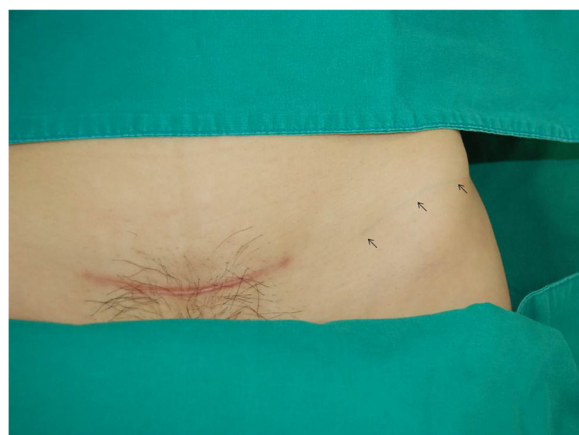
Figure 1 The 10-cm thread-like object in the left lower quadrant of the abdomen (arrows).

Small remnants of nonabsorbable suture materials in the dermis or hypodermis (subcutaneous tissue) are known to migrate toward the superficial layer or occasionally to other sites within the human tissue. The phenomenon can be associated with complications, as reported in plastic surgeries such as blepharoptosis repair [3]. The mechanism of the migration was often thought to be related to foreign body immune reaction or to the force generated in wound contracture. However, no clear explanation has been proposed. To our knowledge, migration of relatively long suture materials, as in the present case, has not been reported yet. We retrieved related literature via PubMed by using keywords “migration”, “movement”, and “suture material”. In our case, the 10-cm length of the nylon suture migrated transversely to a relatively long distance (approximately 15 cm) within the dermis layer, without remarkable tangling of the entire length of the suture.