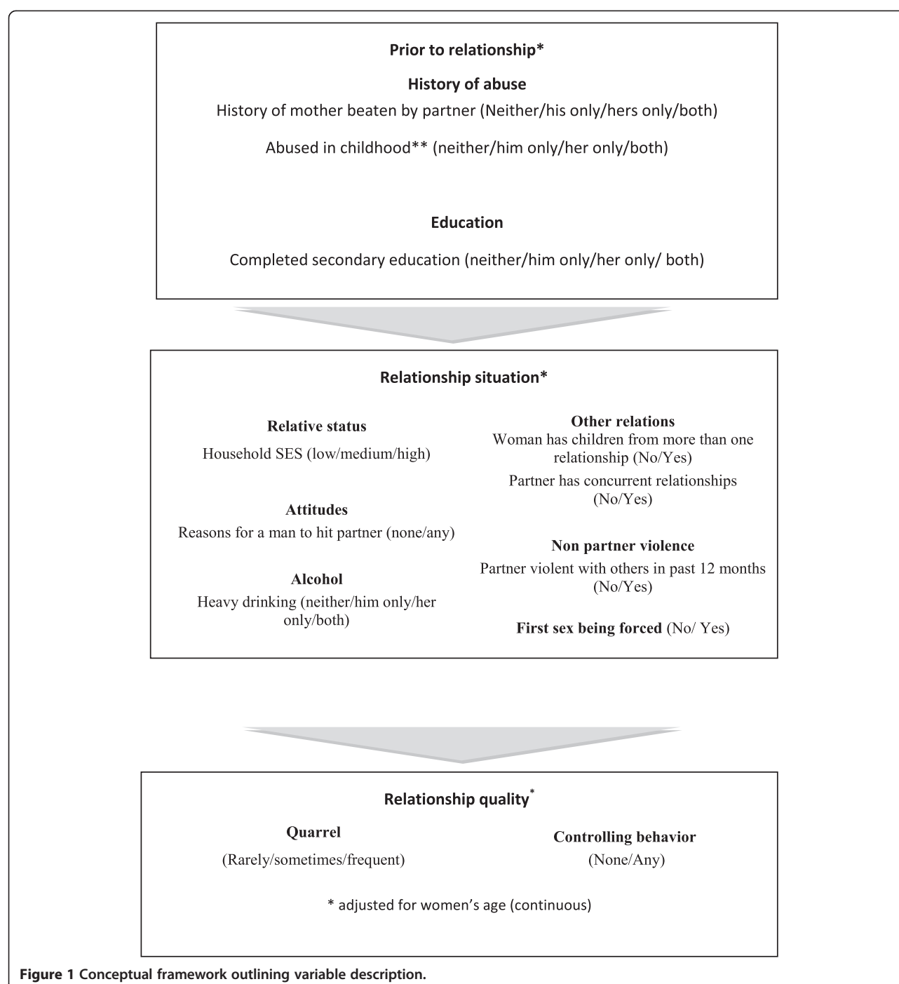
Figure 1 Conceptual framework outlining variable description.

their current relationship and factors indicative of the overall relationship quality. Variables that were included in the analysis that occurred prior to the relationship include whether the woman's or her partner's mother was beaten or both, whether the partner was physically and the woman sexually abused during childhood or both and whether the woman and her partners have a secondary education or both. Variables investigated at the current relationship level include the woman's household status