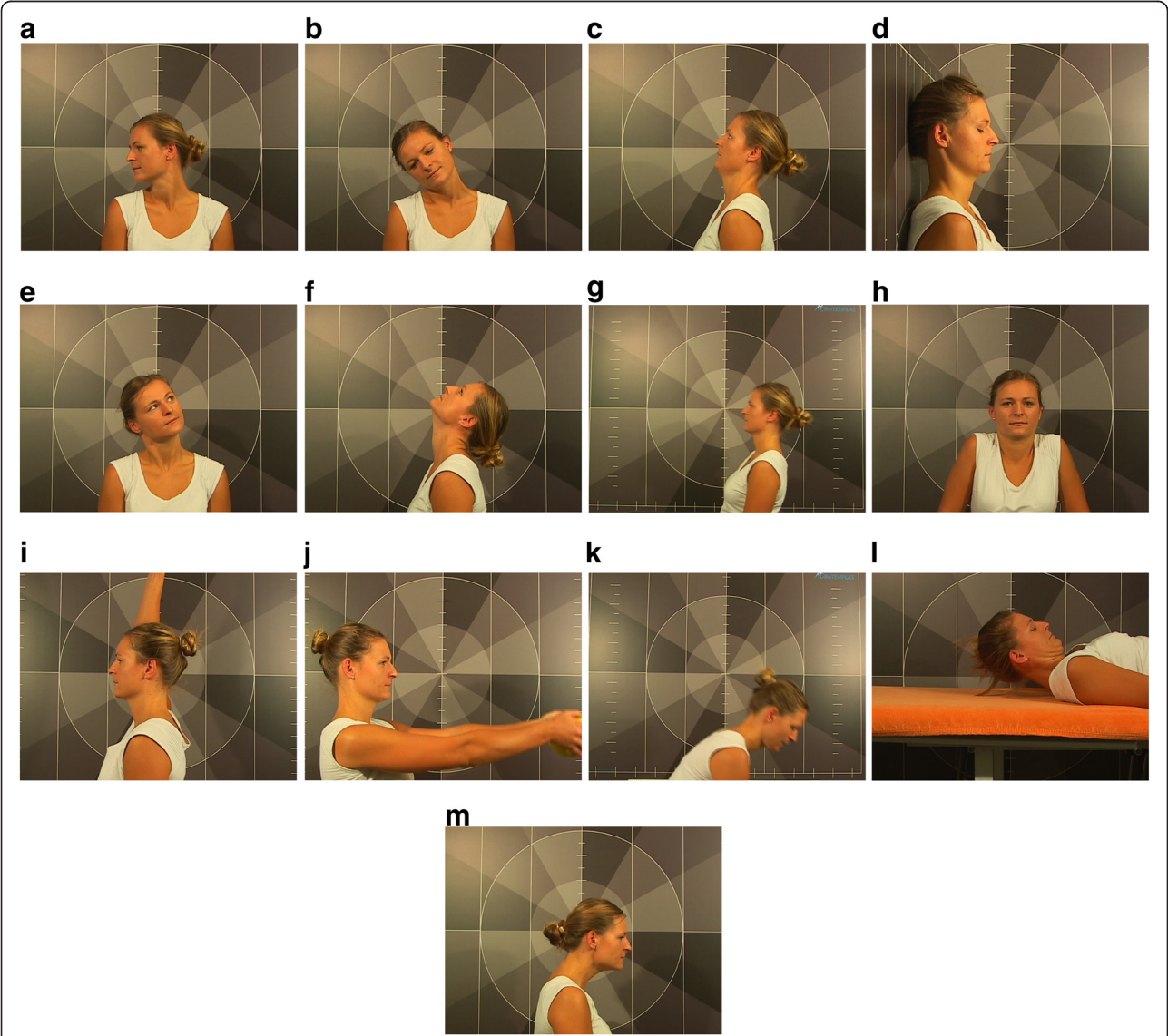
Figure 1 The movement control tests used in the study. a. Rotation. b. Lateral flexion. c. Extension CTJ. d. Nod movement on the wall. e. Upper cervical spine. f. Flexion/Extension full range. g. Upper body forward - backward. h. Bilateral shoulder elevation. i. Unilateral arm flexion. j. Arm flexion 90° with weight. k. Forward bending in standing. l. Neck flexion in supine position. m. Pro/Retraction.

The data was analyzed with the statistical programs R and SSPS 19.0 for Windows. The Kappa coefficient, the