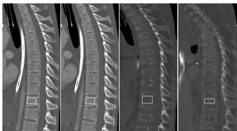
Figure 2 Sagittal plain computed tomographic imaging of the vertebral column over time. Computed tomographic imaging from four different time points are shown. Region of interest within the thoracolumbar vertebral body is marked with a white square. Corresponding Hounsfield Units (HU) at 3 years prior admission (242 HU), admission (238 HU), day 95 of CVHD (52 HU), and day 226 of CVHD (90 HU) are labelled accordingly. Three years prior to admission bone mineral density (BMD) was within physiological limits with age-adjusted configuration within normal limits for the thoracolumbar vertebrae. No significant change was found at admission. A significant decrease in BMD was noted at 4.5 months after admission (day 95 of CVHD), with radiodensity decreasing to 52 HU preventing differentiation between the vertebral body edge and the spinal canal. BMD increased to 90 HU after intervention.