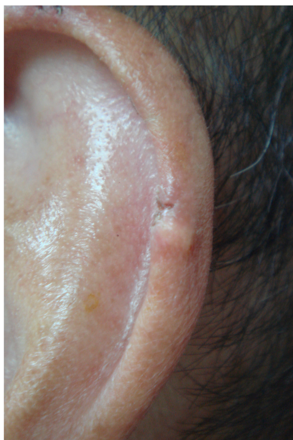
Figure 1 The patient's left auricle has multiple 2.5-mm firm nodules over the helix.

acid level in serum is above 7.0 mg/dL (to convert uric acid level to micromoles per liter, multiply by 59.485), urate crystals form a deposition in subcutaneous tissue, called tophi. Symptoms such as pain, erythema, and swelling are related to the precipitation of uric acid crystals in joint spaces and soft tissues [2]. Primary gout is related to uric acid overproduction, while secondary gout is caused by a decrease in uric acid excretion or by an overproduction of purine. Predisposing factors include aging, male sex, obesity, heavy alcohol consumption, a purine-rich diet, medication use, and genetics. In the patient described herein, the uric acid level was 12.4 mg/dL at 1 week after initiating antituberculosis therapy, and it was 10.1 mg/dL 2 years later. An antituberculosis regimen with pyrazinamide inhibits renal tubular excretion of urate, resulting in some hyperuricemia [3]. Gout tophi occurred at special location like auricular area following a clear history of anti-tuberculosis treatment is unusual. On gross pathological examination, tophaceous gout deposits appear as yellow-white chalky material. The histopathological diagnosis of gouty tophi is made by identifying needle-shaped crystals that are negatively birefringent under polarized light [4]. The