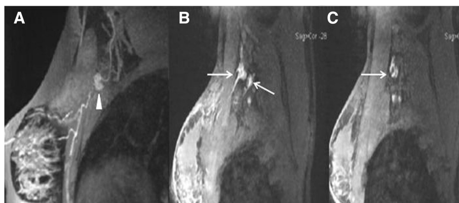
Figure 3 Comparison of MRL images between benign and malignant SLNs. A: Benign SLN in a 41-year-old woman with left breast ductal carcinoma. The lymph node displays homogeneous enhancement (white triangle) in Gd-MRL. B, C: Malignant SLNs in a 48-year-old woman with left breast ductal carcinoma. Heterogeneous enhancement and enhancement defect were found in Gd-MRL (white arrows).

Histopathological examination of sentinel lymph node biopsy is the standard procedure to detect axillary lymph node metastasis. Both radioisotope (technetium-99 m) and blue dyes (isosulfan blue or patent blue) are widely used for lymphatic mapping and SLN identification. The combination of blue dye and radioisotope has a higher SLN identification rate than that of blue dye alone; however, there is no significant difference in the SLN identification rate between blue dye alone versus radioisotope alone [23,24]. However, the radioguided approach to SLN identification requires utilization of radioisotope (technetium-99 m) and gamma detection probe equipment