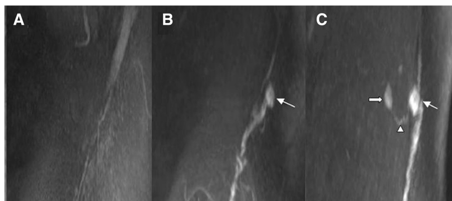
Figure 1 Gd-MRL images in a 46-year-old patient with left breast ductal carcinoma. Compared with pre-contrast images (A), the axillary lymphatic pathway was dynamically stained 9 min (B) and 18 min after contrast injection (C). The SLN could be easily identified on Gd-MRL (white thin arrow). One distant node (white thick arrow) and its connection lymph vessel (white triangle) with an SLN are also displayed.

In Gd-MRL imaging, 28 M-SLNs were confirmed to have metastases; 25 of them showed heterogeneous