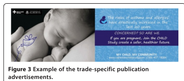
Figure 3 Example of the trade-specific publication advertisements.

For both free and paid-media, we analyzed (Poisson regression for count data) for the number of individuals who reported being recruited as a results of a specific advertisement (media-specific recruits) and for all individuals recruited during each advertising intervention as a reflection of increased general awareness of the CHILD study (multi-level Poisson regression controlling for the specific clinics for the fax and in-clinic referrals). We considered a lag between 1 to 4 days in the models (using auto-correlation) to capture the delay between advertising and an individual's response to the advertisement. For each advertising intervention we included referrals received up to 2 days after the last advertisement as part of