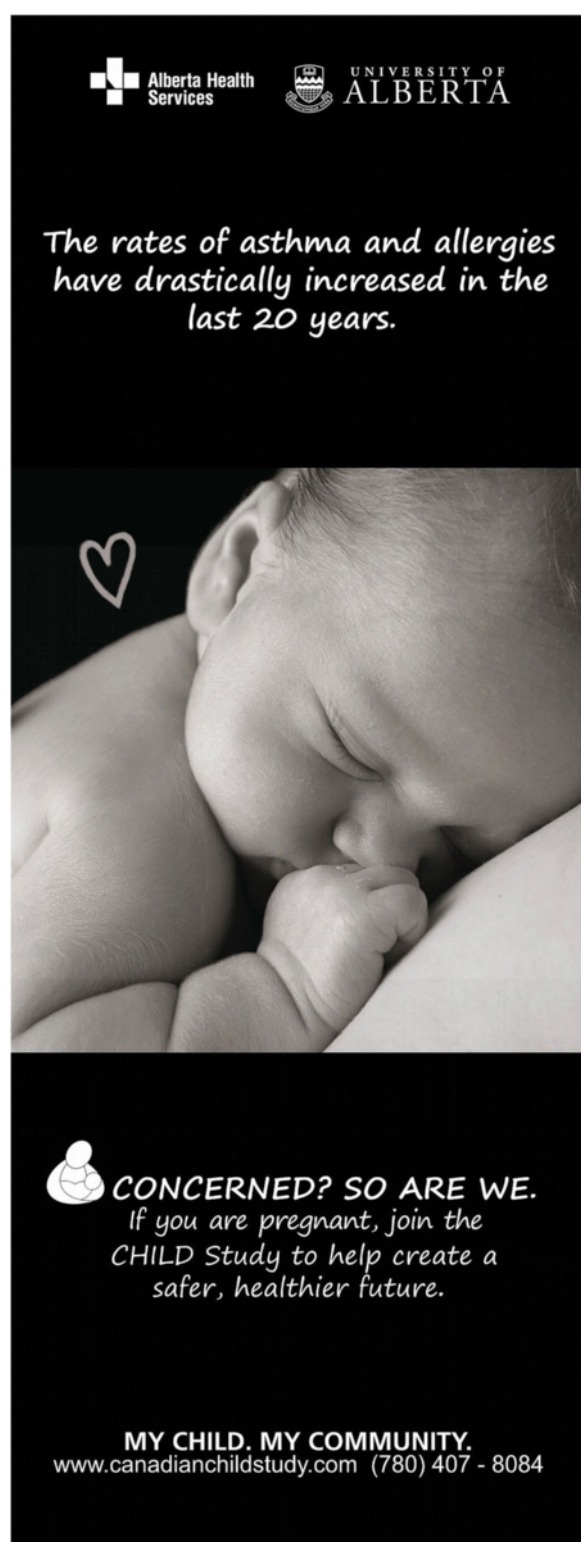
Figure 5 Birth Issues Ad.

We have recruitment data on 4123 individuals (3169 eligible referrals, 954 ineligible referrals based on study inclusion and exclusion criteria). Of 3169 eligible individuals, 982 individuals (31%) were successfully recruited. Table 3 provides the demographic differences between individuals recruited and non-recruited individuals among those referred. Amongst those recruited, we noted significant differences in recruitment success and participant demographics by recruitment method.