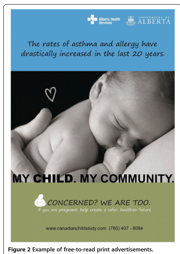
Figure 2 Example of free-to-read print advertisements.

used by research studies, 2) had the largest sample size and 3) fax was the first recruitment strategy utilized.