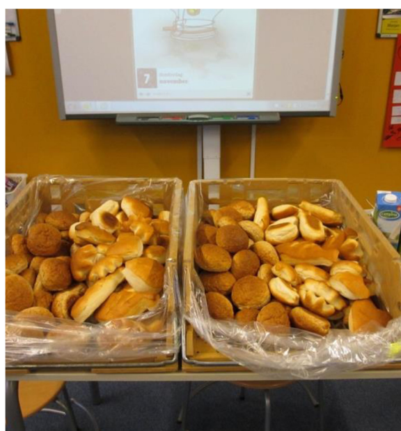
Figure 1 Presentation of bread rolls in classroom.

exchange bread rolls with them. After breakfast, children were asked to fill in a questionnaire (see Survey).