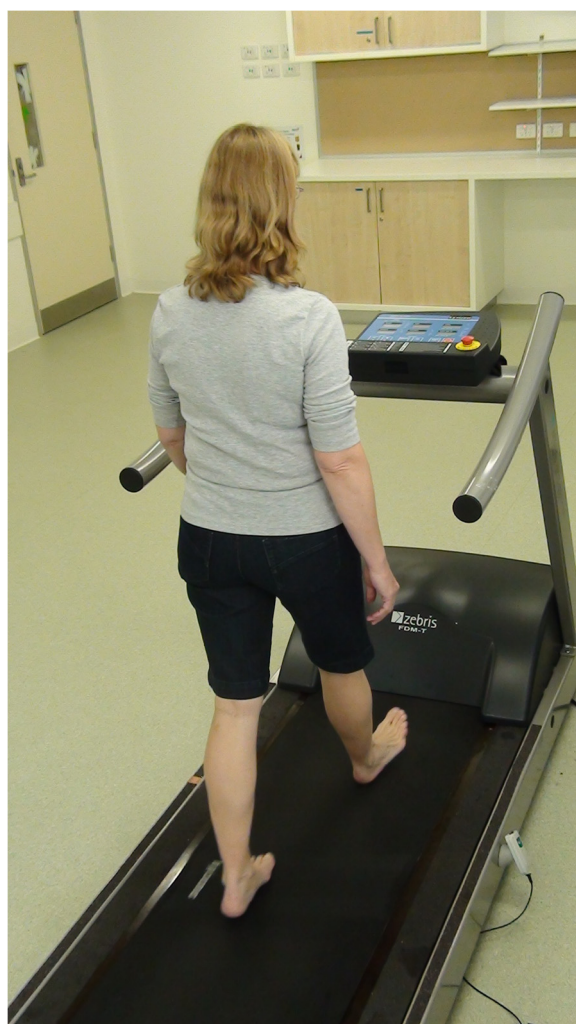
Figure 1 Instrumented treadmill system. Spatiotemporal gait parameters and ground reaction forces were estimated using an instrumented treadmill system that incorporated a capacitance-based pressure array consisting of 7,168 transducers with a spatial resolution of 0.85 cm.

parameters is typically lowest at self-selected gait speeds [20], participants were instructed to set a comfortable walking pace for each testing session, but were blinded to the selected treadmill speed.