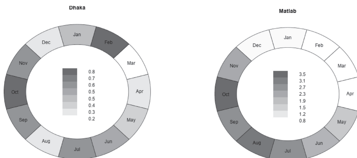
Figure 1 Time trend and seasonal distribution of Typhoidal Salmonella in Dhaka and Matlab (2000–2012).

( p < 0.001 ) but no significant effects were seen at Dhaka. In addition to a common seasonal peak later in the year, a peak was also observed in urban Dhaka early in the year of winter months of January and February. Seasonal upsurges of pathogen is well documented elsewhere for other common diarrheal pathogens such as rotavirus [23], Vibrio cholerae [24] or Shigella [25,26]. Several environmental as well as host characteristics may explain underlying predictions [27,28]. Moreover,