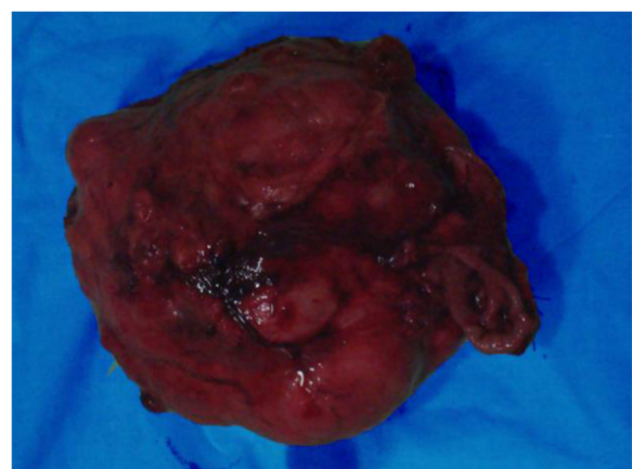
Figure 4 Resected surgical specimen of GIST.