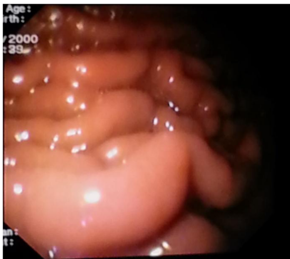
Figure 1 Upper gastrointestinal endoscopy showing normal mucosa of stomach.

2nd part of the duodenum and revealed a normal mucosa of the stomach (Figure 1). Abdominal CT scan showed a mass lesion (12×8×11 cm) of the left lobe of the liver with enhancement during arterial phase and washout during venous phase. The impression of the radiologist was a hepatocellular carcinoma, most probably of fibrolamellar type due to star sign within the lesion (Figure 2). The operative plan was laparoscopy and left hemi hepatectomy. Laparoscopic exploration was performed for under general anaesthesia. On the laparoscopic examination, the appearance of the liver was completely normal. There was a large solid mass arising from the lesser curvature of the stomach. There were no regional lymph node enlargement. There were no peritoneal deposits and also pelvic organs were appeared normal on laparoscopy. Then patient underwent open surgery which involved ligation of