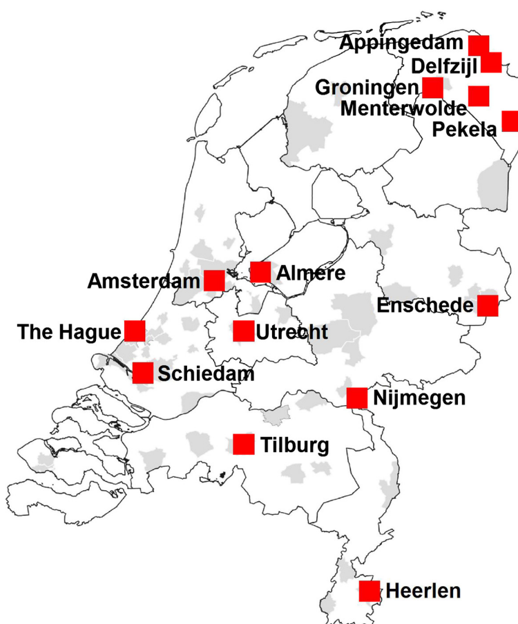
Figure 3 Participating municipalities in the 'Healthy Pregnancy 4 All' project.

services. Organisation and logistics regarding out roll of the two sub studies is presented in the specific design papers.