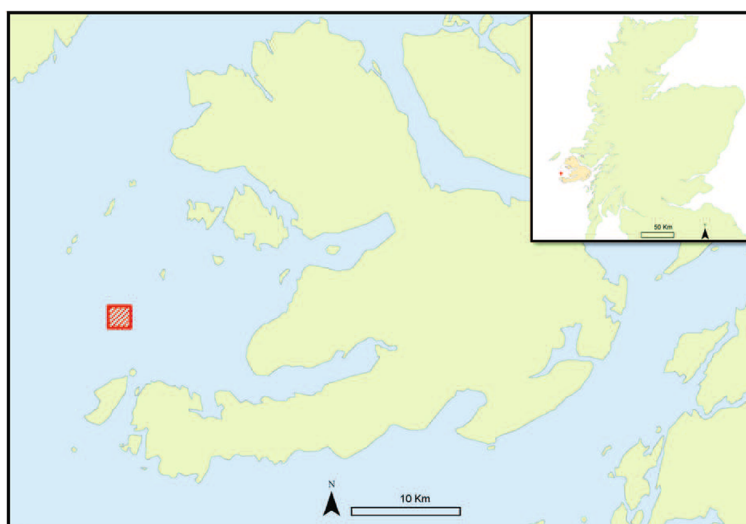
Figure 3 Area needed to grow enough seaweed to meet domestic gas requirements for homes on the Isle of Mull, West coast of Scotland, based on a production of 200 wet tonnes ha -1 .

aquaculture, fisheries, energy generation and shipping is required.