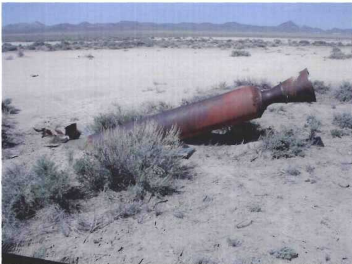
Photograph 1 – Initial site condition of CAU 496 rocket (facing west), 10/03/2006

The excavation was radiologically surveyed, and the three areas with the highest readings were selected for collecting verification samples to document clean closure. Verification samples were collected for uranium metal and isotopic uranium analyses. Additional quality assurance blind duplicate and equipment blank samples were collected to support the analytical objectives. After collecting verification samples, the site was secured, and depleted uranium waste was containerized under the supervision of a Waste Certification Official for subsequent offsite disposal.