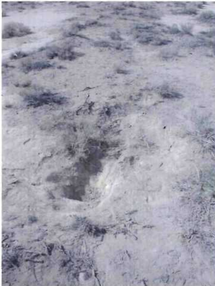
Photograph 4 – Location of additional soil removal, 04/10/2007

Copies of the analytical result summaries are attached.