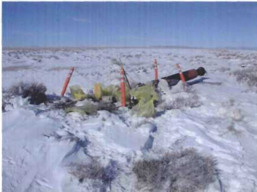
Photograph 2 – CAU 496 rocket site during cleanup (facing northwest), 12/19/2006