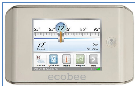
Figure 2. Ecobee thermostat

New technologies also provide opportunities for better monitoring. Devices that differentiate between consumptive uses provide greater resolution into residential energy patterns, which assists homeowners in analyzing areas for potential improvement. Additionally, such