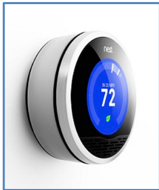
Figure 1. Nest Labs thermostat

These differentiations are not usually apparent to consumers, as detailed breakdowns of energy use and costs are seldom available. In such instances, consumers may contact the service providers with complaints of unrealized energy savings. At present, service providers seldom have the capability to rigorously analyze customer energy habits, which could possibly show how changes in behavior affected energy use. Some new thermostats available on the market are able to monitor and record temperature set-points, providing a record of consumer behavior to assist in diagnosis. For instance, the new Nest Labs thermostat from former iPod designer Tony Fadell uses algorithms and user input to develop a “schedule” for energy usage that manages heating and air-conditioning to promote savings. The device, which was released in 2011, is available for $249. Other market-ready models, noted in Section 4.3 below, provide various capabilities to record and program thermostat parameters at a wide range of prices.