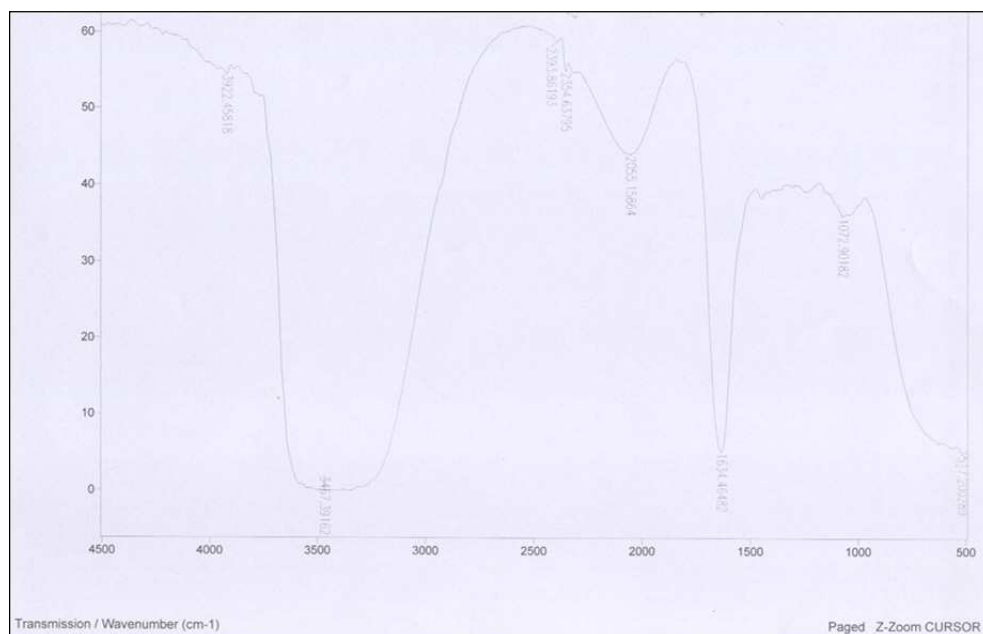
Fig. 1. FTIR spectrum of Gliocladium viride ZIC 2063 .