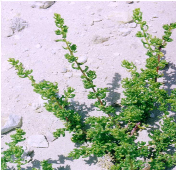
Figure 7. Suaeda aegyptiaca shoots.