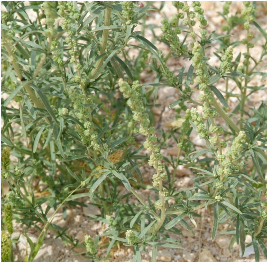
Figure 4. Oligomeris linifolia habit.

also by osmotic adjustment [15, 39] through accumulation of substantial amounts of organic and inorganic solutes like proline, glycinebetaine, sugars and inorganic ions to cope with soil of severe water shortage [3, 40-42]. Plants such as Tetraena qatarense and Ochradenus baccatus , are good examples of xerophytes having dehydration avoidance mechanism by accumulating solutes to withstand severe water stress [4]. Dehydration tolerance mechanism, on the other hand, includes some methods like avoidance of starvation strain by stomatal opening at low \Psi_w , uncoupling of photosynthesis from transpiration, low respiration rate and other secondary mechanisms include: tolerance of starvation strain, avoidance of protein loss, and tolerance of protein loss [15]. Understanding these secondary mechanisms needs extensive and deep investigation in the plants covered in this review.