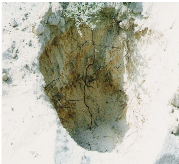
Figure 5. Some plants have roots growing in the deeper soil layers toward the water table, Helianthemum lipii .