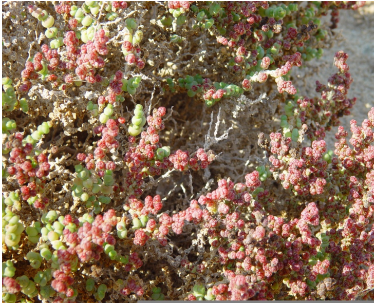
Figure 6. Halopeplis perfoliata habit.