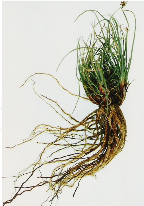
Figure 2. Cyperus conglomeratus has high root / top ratio.