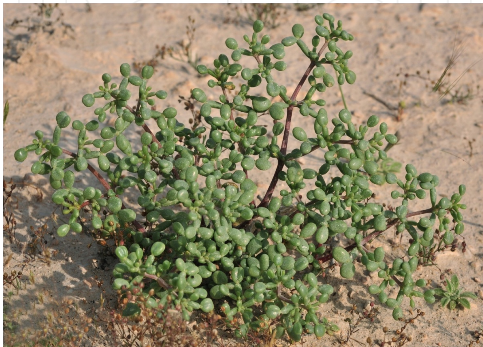
Figure 3. Branches of Tetraena qatarense with the fleshy leaves and woody stems.

in spite of its succulence characteristic and its ability to store water in different plant parts (Fig. 4). This species has been considered as a desert species suspected as halophyte. Its life form was considered as Sub-Fruticose Chamaephytes, erect fruit shoot at base [38]. It grows in various habitats, including disturbed areas and saline soils, in deserts, plains, coastline, and other places. It is a fleshy annual plant, producing several erect, ribbed stems 35 to 45 centimeters in maximum height. Although these plants are considered as xerophytes, they might have also well adapted to saline environments, since they are living in soils of high salinity levels [4].