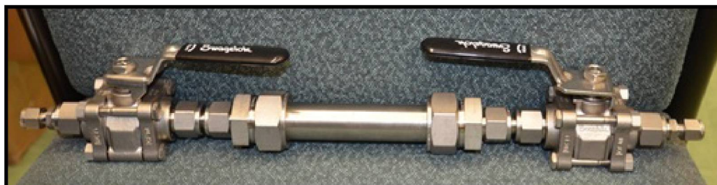
Figure 2: Sample holder for NO 2 aging of I 2 -Ag 0 Z

Four stainless steel sample holders were manufactured from 6 inch sections of 316 stainless steel tubing (wall thickness 0.083 inch; internal diameter 0.834 inch). An assembled sample holder is shown in Figure 2. Valves on either end allowed gas flow through the chamber during air purging.